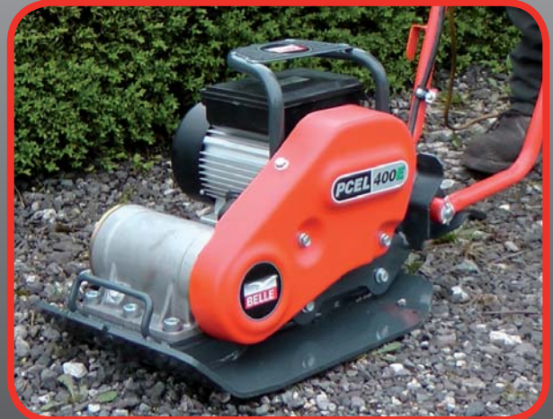
Ideal for Professional & 'DIY' users