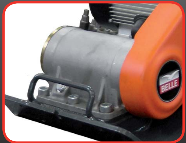
10.5kN Vibration Unit & Front Lifting Handle